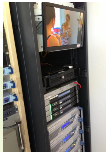
New digital receivers, transmitters and MPEG2 transcoders installed at Leonora self-help site

Satellite Television and Radio Australia Pty Ltd on: Telephone: + 61 (07) 3103 0477